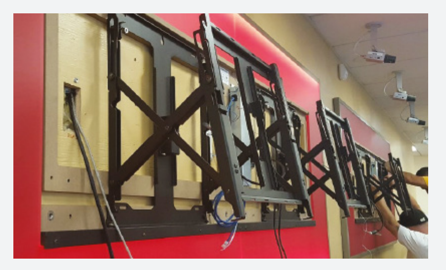
Our electrical services provide robust code-compliant wiring and installation, all while powering CCTV surveillance systems tailored for your facilities' security solutions.