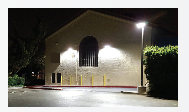
LED Lighting Upgrade