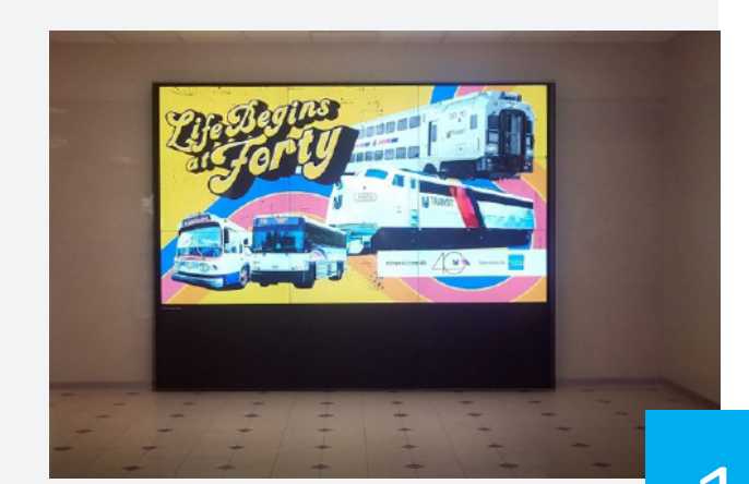
Large Format Video Wall Installation - Secaucus Junction Rail Station