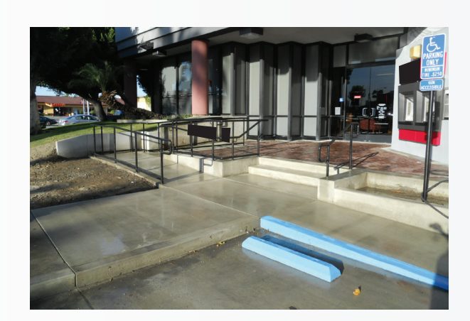
ADA Site Upgrade